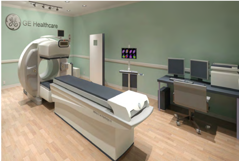
7-68 - Infinia II w-Hawkeye 4

Hold the Left Click for Rotating around Use the Scroll for Zooming in and out