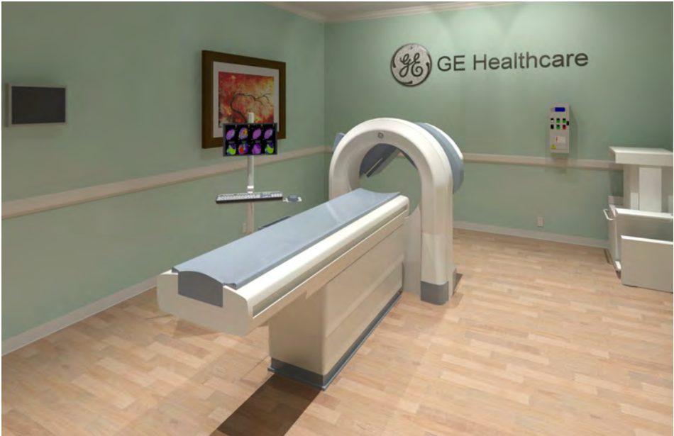
7-66 - Ventri w Premium Table

Hold the Left Click for Rotating around Use the Scroll for Zooming in and out